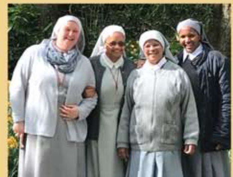
SCOTLAND 57 Motherwell Road Bellshill, Lanarks. ML4 2JA Tel 01698 747 112 Reg. Charity No. SCO16741

Cover photo: Boy from Swaziland