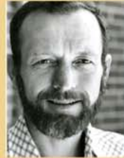
Stanley Francis Rother, American missionary priest martyred in Guatemala 27/III/1935 – 28/VII/1981 Sololà, Guatemala Beatified 23/IX/2017