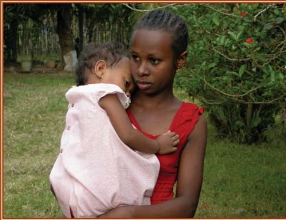
Mother and child from Ambanja, Madagascar. Missionaries do all they can to sustain young mothers with health care and the means for the education of their children, the future of the Church and of society.