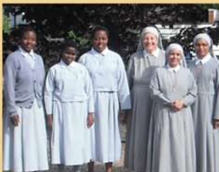
ENGLAND 89 Shortlands Road Bromley, Kent, BR2 0JL Tel 020 8313 3915 Reg. Charity No. 1048906