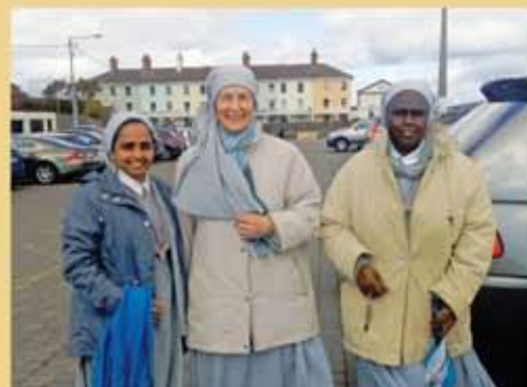
IRELAND 81 Bushy Park Rd Terenure, Dublin D06 V6Y9 Tel 01 490 93 60 Reg. Charity No. 3462